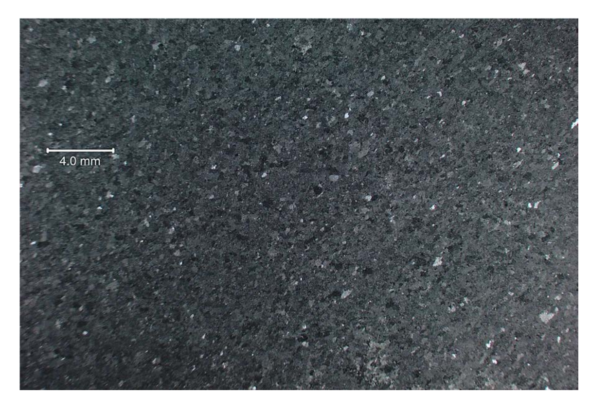
SAMPLE ID: MAG: