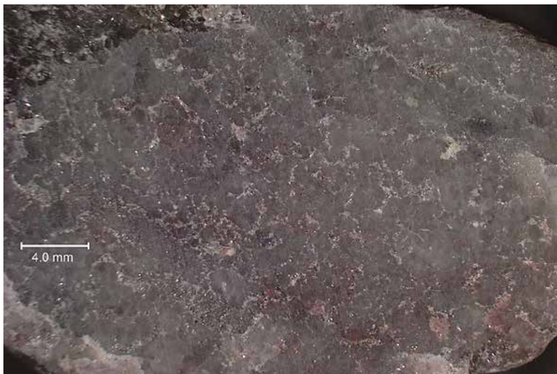
SAMPLE ID: #21 Sterling Quartz MAG: 5x DESCRIPTION: View of the lapped cross section of the stone.