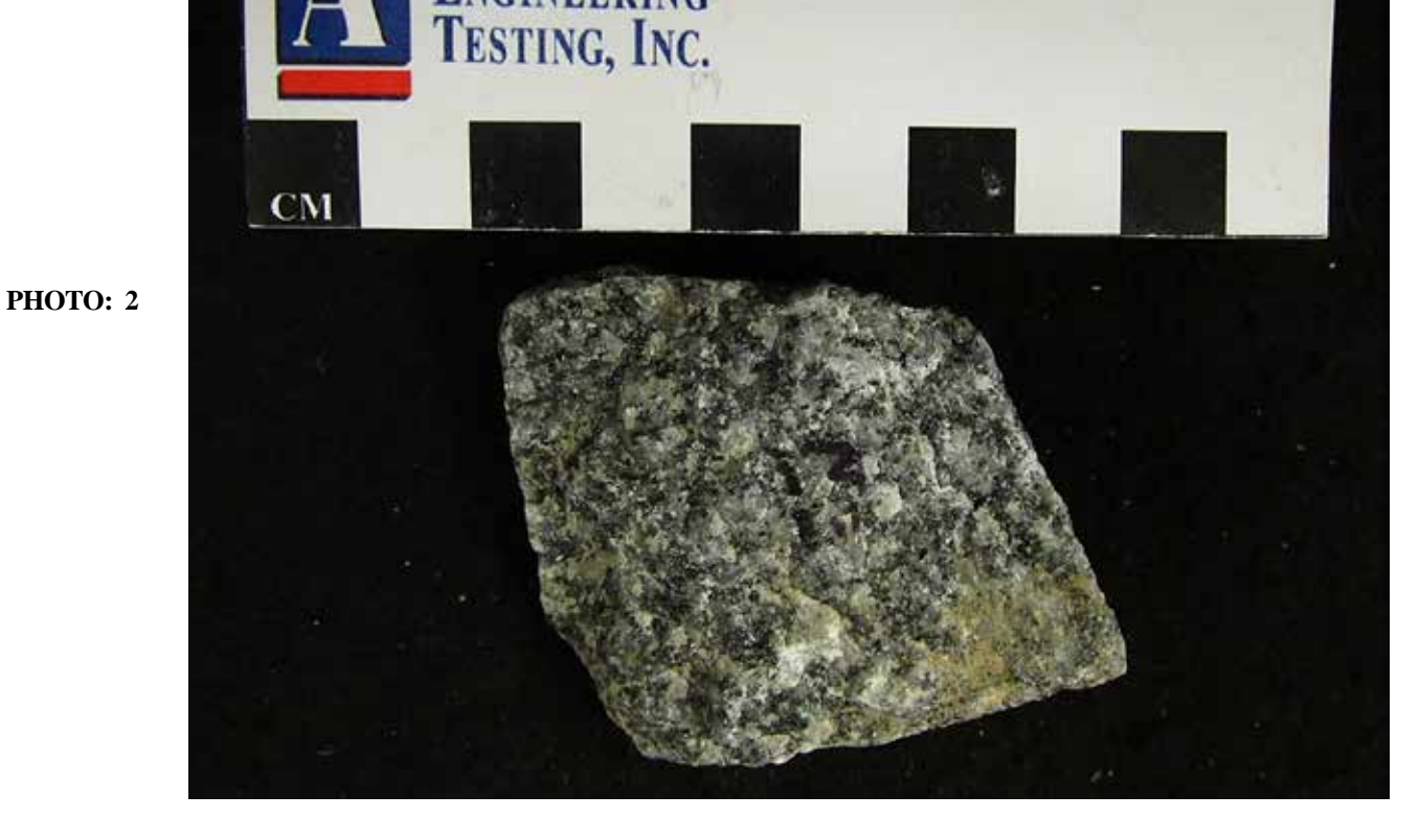
SAMPLE ID: #13 Imperial Grey Granite DESCRIPTION: Overall view of the sample as received.