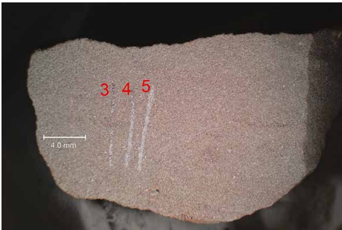
SAMPLE ID: #2 Golden Cream Marble MAG: 5x DESCRIPTION: View of the lapped cross section of the stone after Mohs hardness testing. Note that hardness pick 3 scratched a few minerals, hardness pick 4 scratched almost all of the minerals, and hardness pick 5 scratched all minerals. The general Mohs hardness would be approximately 3 to 3.5.