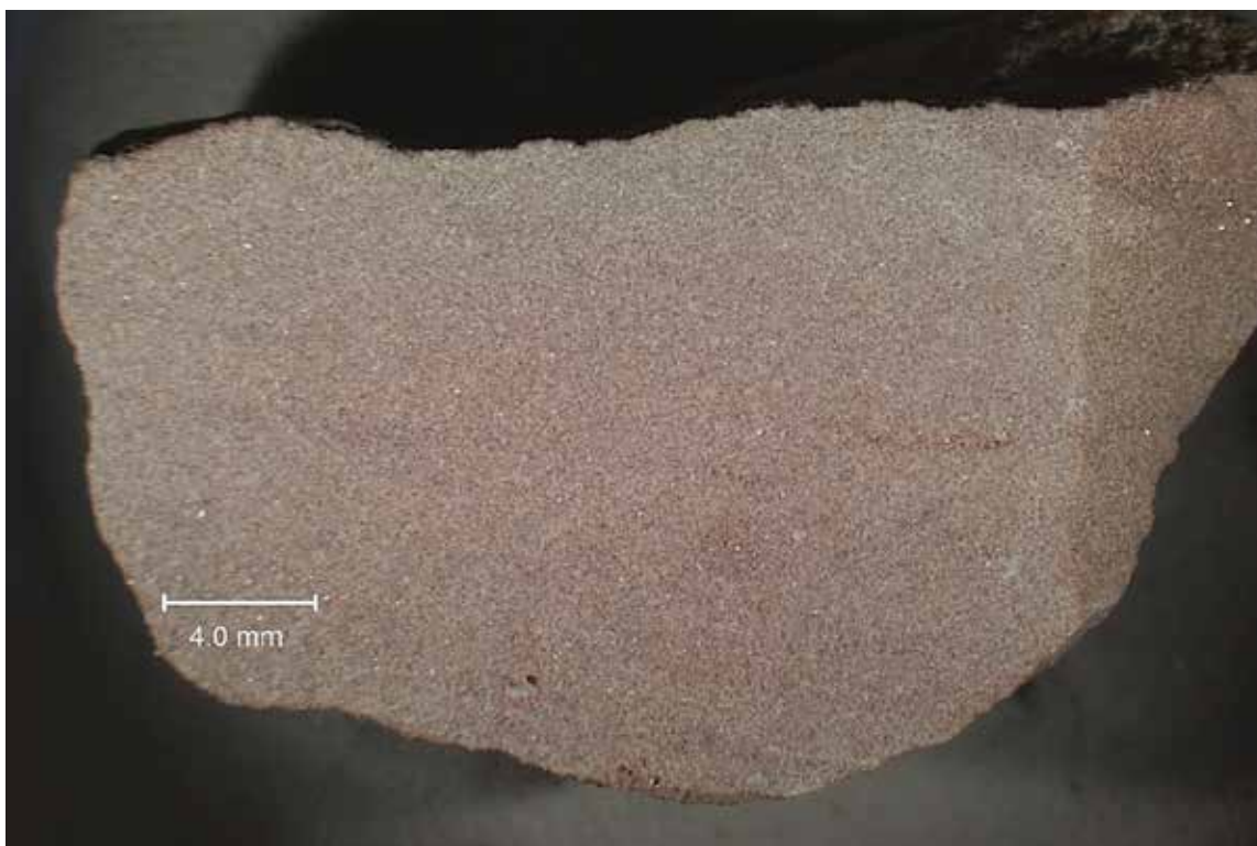
SAMPLE ID: #2 Golden Cream Marble MAG: 5x DESCRIPTION: View of the lapped cross section of the stone.