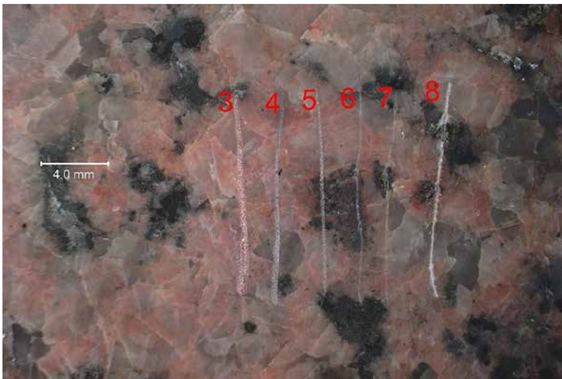
SAMPLE ID: Dynamite Orange Granite DESCRIPTION: View of the lapped cross section of the stone after Mohs hardness testing. Note that hardness picks 3, 4, 5, and 6 did not scratch, hardness pick 7 scratched a few minerals, and hardness pick 8 scratched all minerals. The general Mohs hardness would be approximately 7 to 7.5. MAG: 5x