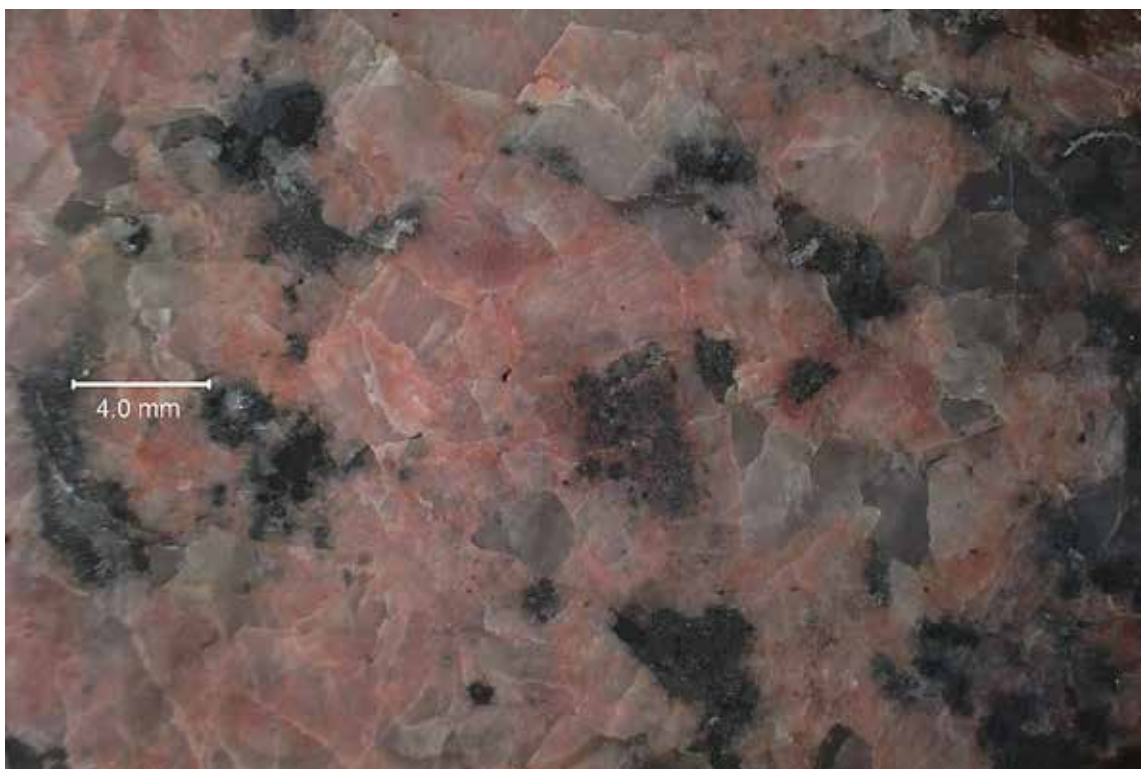
SAMPLE ID: Dynamite Orange Granite DESCRIPTION: View of the lapped cross section of the stone. MAG: 5x