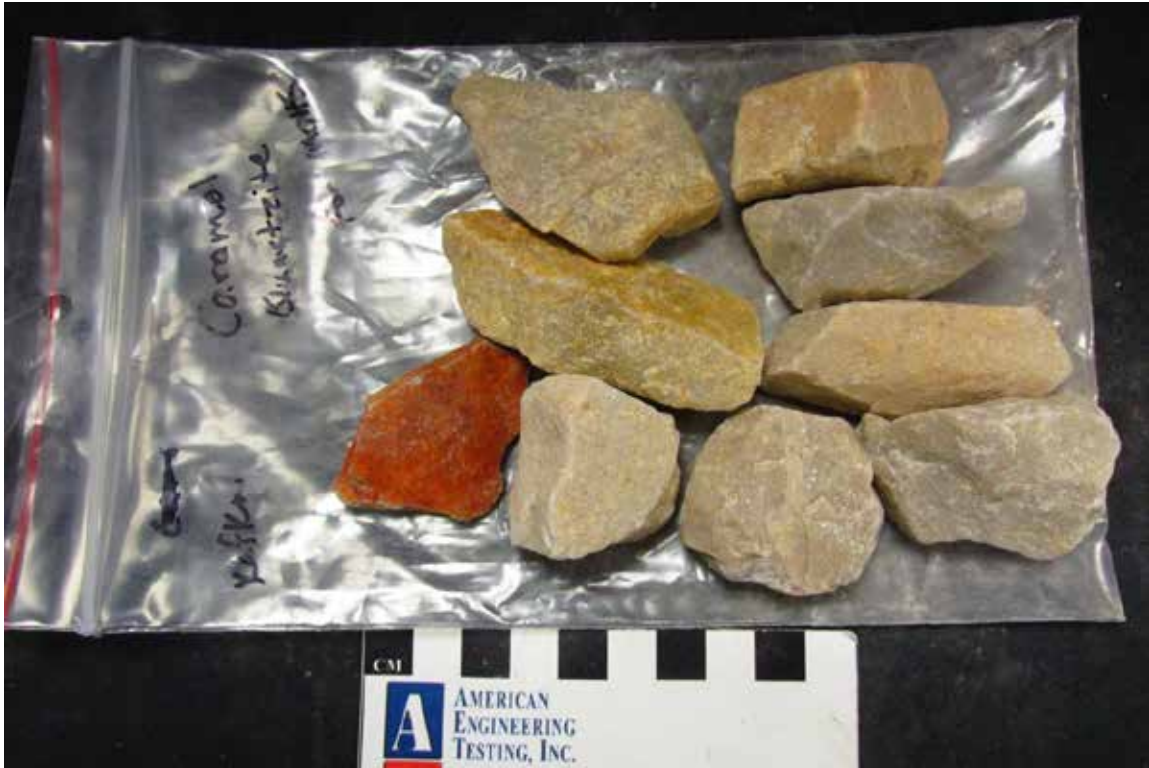
SAMPLE ID: Caramel Quartzite DESCRIPTION: Overall view of the sample as received.