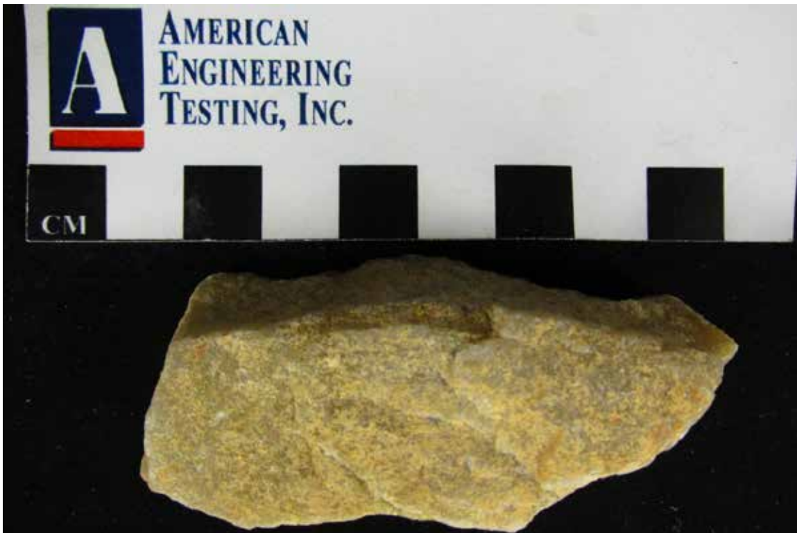
SAMPLE ID: Caramel Quartzite DESCRIPTION: View of the stone selected for hardness testing.