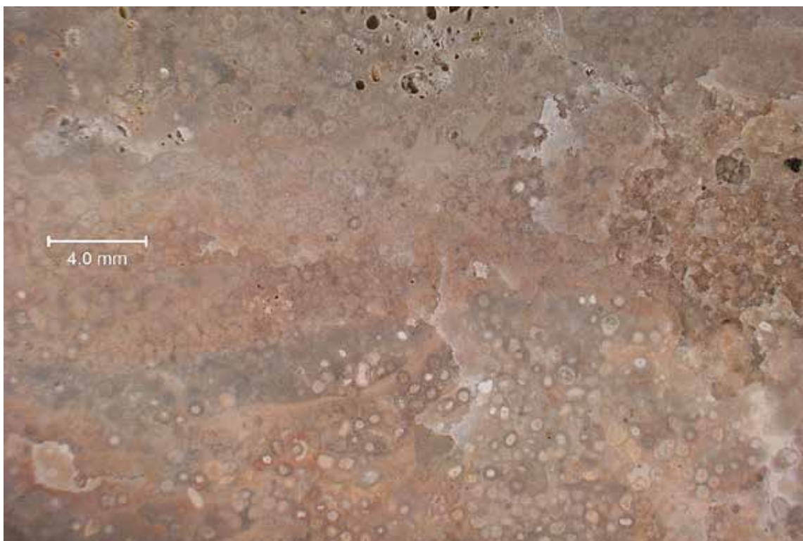
SAMPLE ID: MAG: