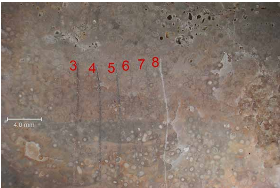
SAMPLE ID: MAG: