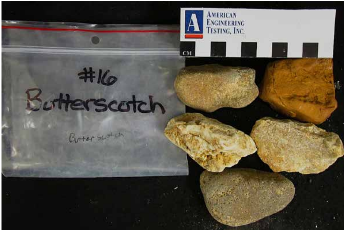
SAMPLE ID: #16 Butterscotch DESCRIPTION: Overall view of the sample as received.