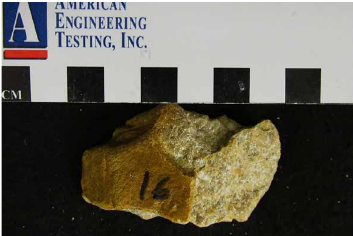
SAMPLE ID: #16 Butterscotch DESCRIPTION: View of the stone selected for hardness testing.