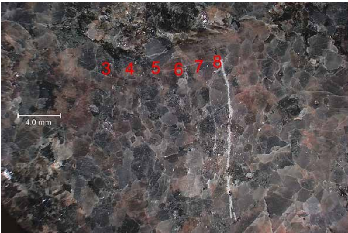
SAMPLE ID: #11 Blue Mahogany MAG: 5x DESCRIPTION: View of the lapped cross section of the stone after Mohs hardness testing. Note that hardness picks 3 thru 6 did not scratch, hardness pick 7 scratched a few minerals, and hardness pick 8 scratched all minerals. The general Mohs hardness would be approximately 7 to 7.5.