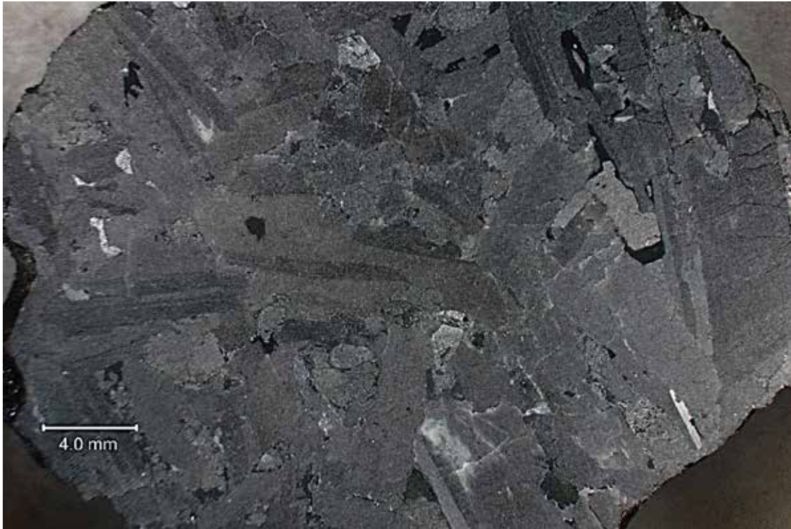
SAMPLE ID: Sample #6-Starlight Black 3/8x1/8 MAG: 5x DESCRIPTION: View of the lapped cross section of the stone.