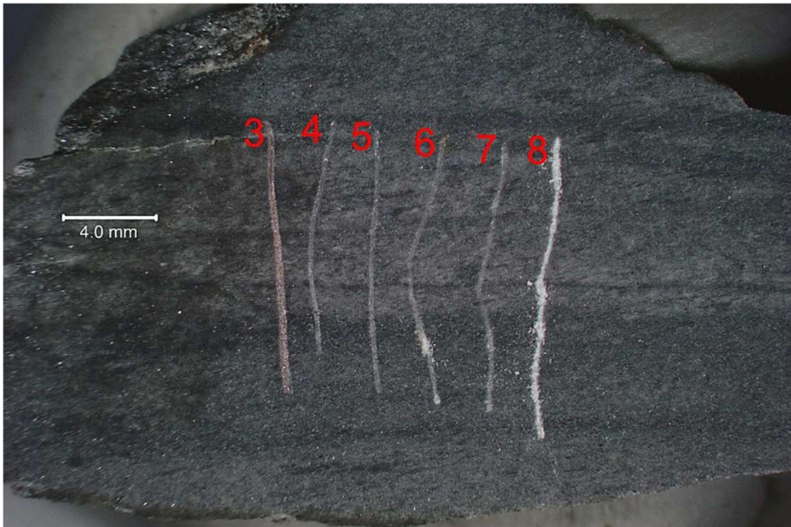
SAMPLE ID: MAG: