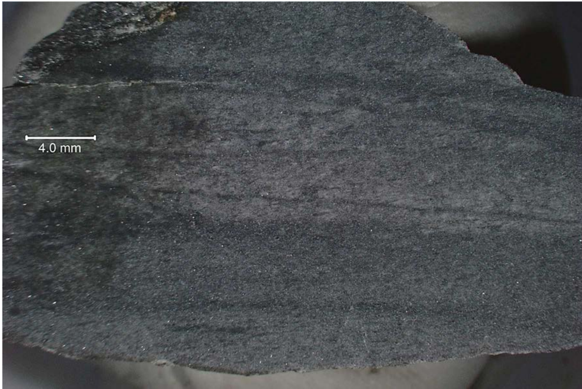
SAMPLE ID: MAG: