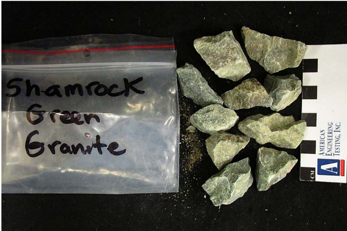
SAMPLE ID: Shamrock Green Granite DESCRIPTION: Overall view of the sample as received.