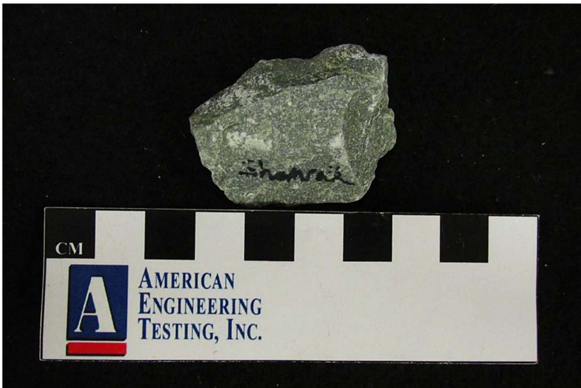
SAMPLE ID: Shamrock Green Granite DESCRIPTION: View of the stone selected for hardness testing.