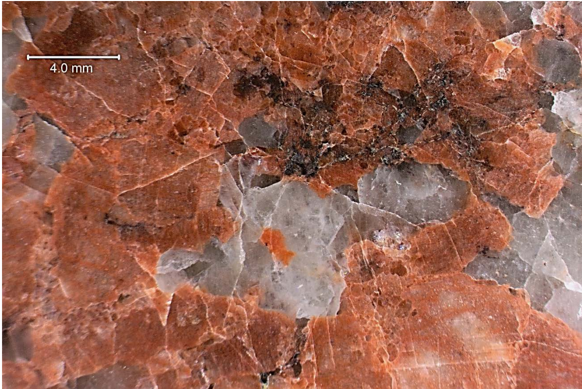
SAMPLE ID: MAG: