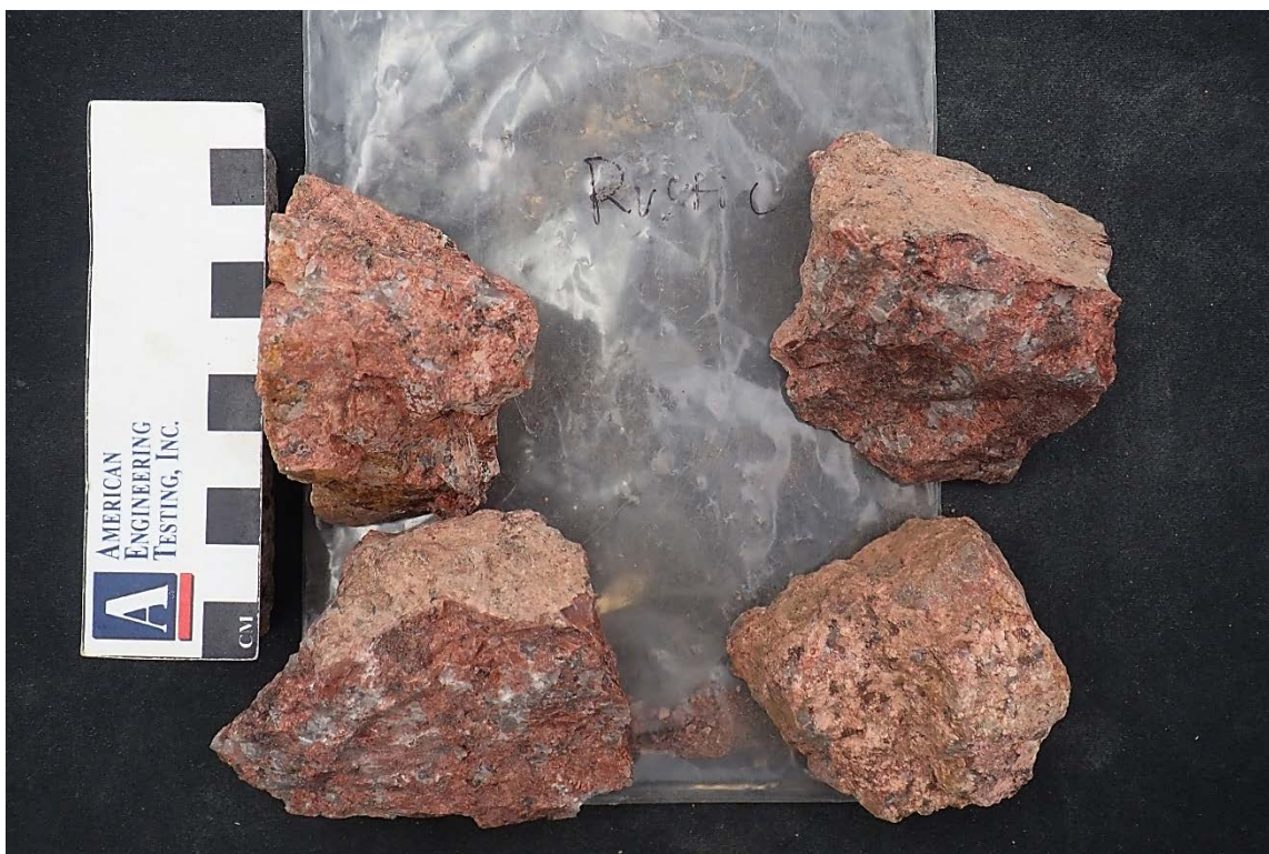
SAMPLE ID: Rustic Granite DESCRIPTION: Overall view of the sample as received.