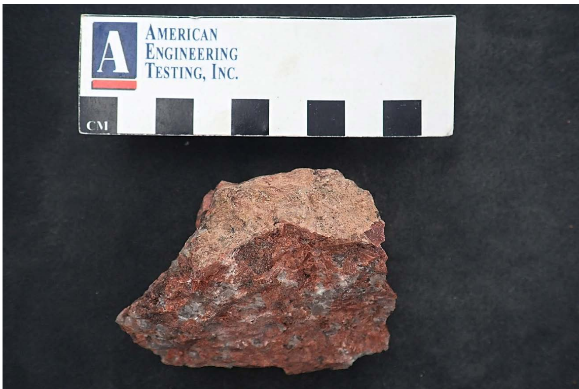
SAMPLE ID: Rustic Granite DESCRIPTION: View of the stone selected for hardness testing.