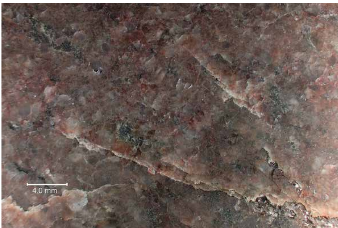
SAMPLE ID: Sample #2-Mauve 3/8x1/8 MAG: 5x DESCRIPTION: View of the lapped cross section of the stone.