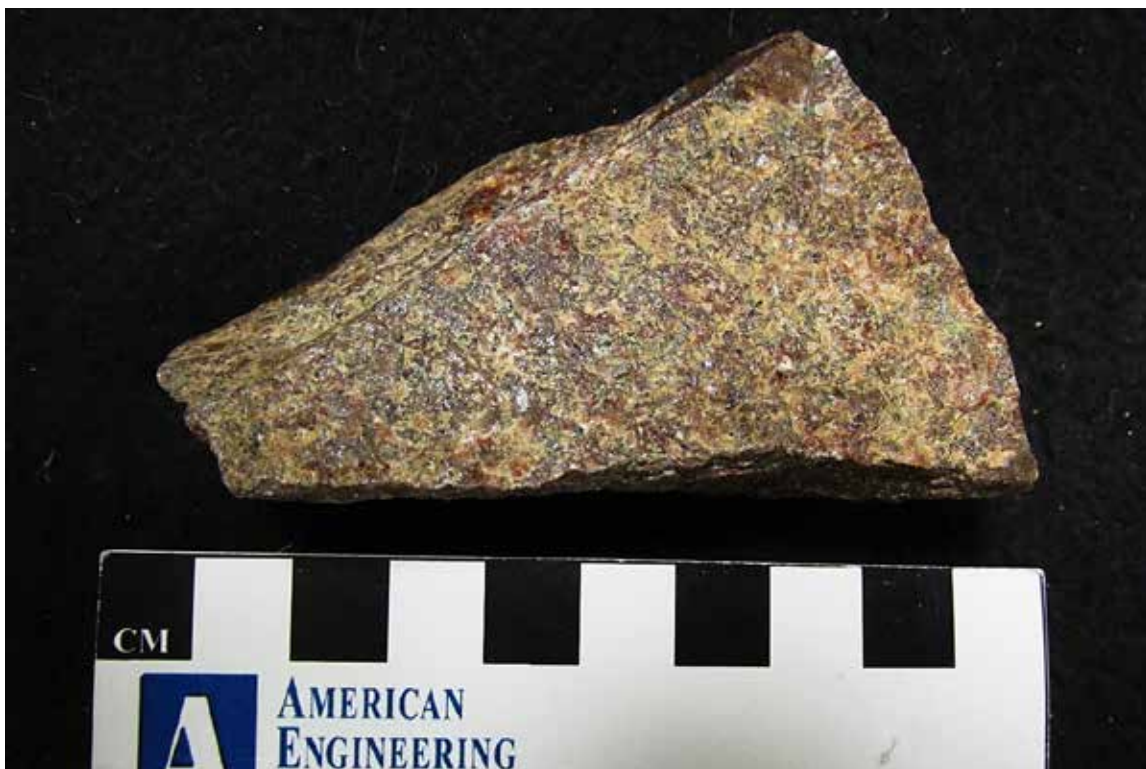
SAMPLE ID: Sample #2-Mauve 3/8x1/8 DESCRIPTION: View of the stone selected for hardness testing.