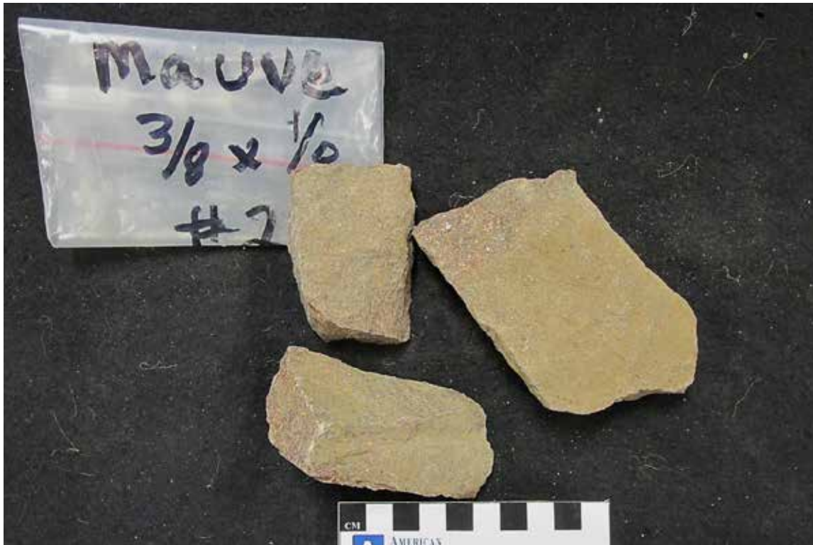
SAMPLE ID: Sample #2-Mauve 3/8x1/8 DESCRIPTION: Overall view of the sample as received.