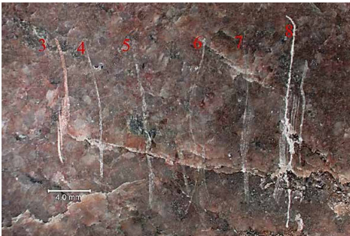
SAMPLE ID: Sample #2-Mauve 3/8x1/8 MAG: 5x DESCRIPTION: View of the lapped cross section of the stone after Mohs hardness testing. Note that hardness picks 3, 4, 5, and 6 did not scratch, hardness pick 7 scratched a few minerals, and hardness pick 8 scratched all minerals. The general Mohs hardness would be approximately 7.