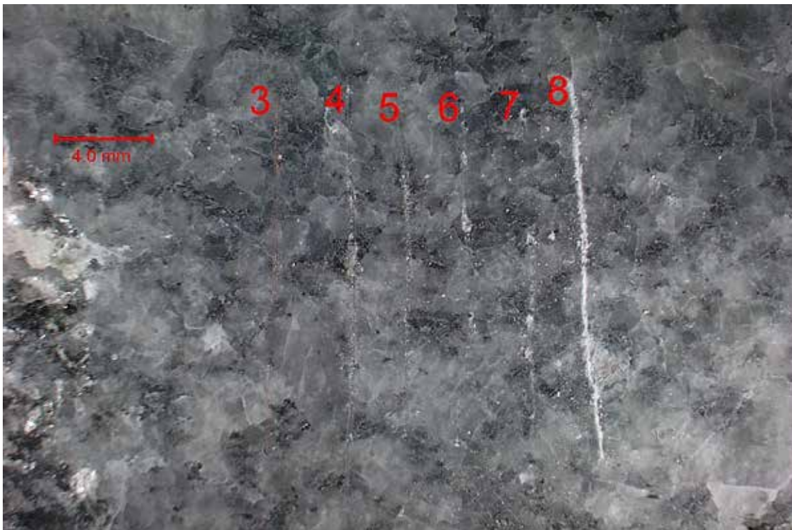
SAMPLE ID: #13 Imperial Grey Granite DESCRIPTION: View of the lapped cross section of the stone after Mohs hardness testing. Note that hardness picks 3 thru 5 did not scratch, hardness picks 6 and 7 scratched a few minerals, and hardness pick 8 scratched all minerals. The general Mohs hardness would be approximately 7 to 7.5. MAG: 5x