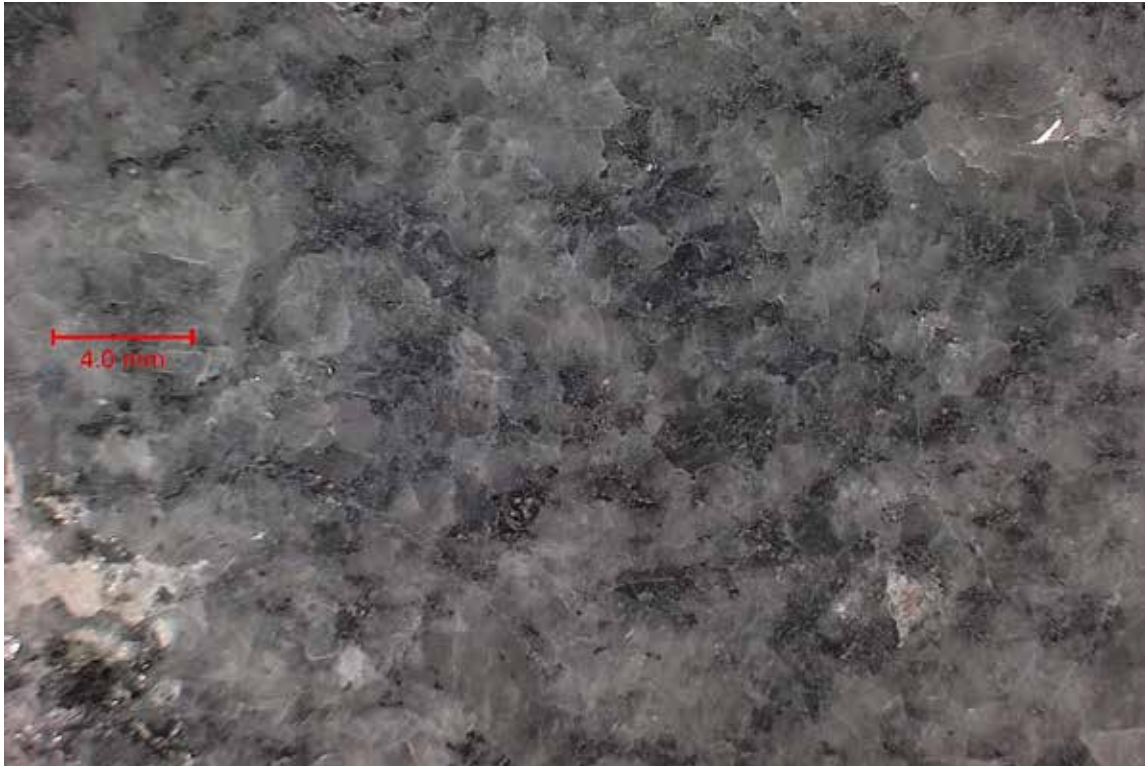
SAMPLE ID: #13 Imperial Grey Granite DESCRIPTION: View of the lapped cross section of the stone. MAG: 5x