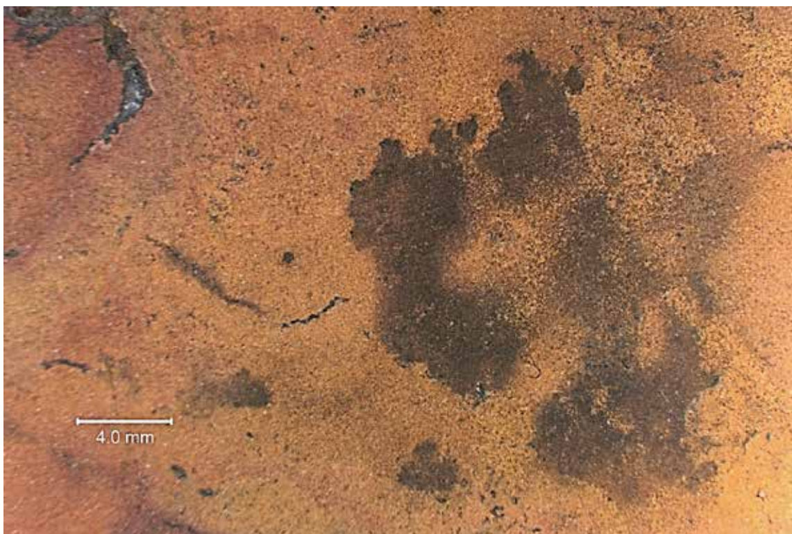
SAMPLE ID: Sample #4-Burnt Sienna 3/8x1/8 MAG: 5x DESCRIPTION: View of the sawcut and lapped cross section of the stone.