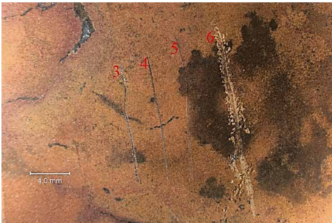
SAMPLE ID: Sample #4-Burnt Sienna 3/8x1/8 MAG: 5x DESCRIPTION: View of the lapped cross section of the stone after Mohs hardness testing. Note that hardness picks 3 and 4 did not scratch, hardness pick 5 scratched a few minerals, and hardness pick 6 scratched all minerals. The general Mohs hardness would be approximately 5.