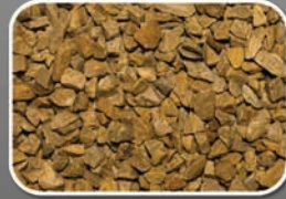
AUTUMN BLEND MARBLE*