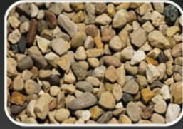
BUFF RIVER BLEND