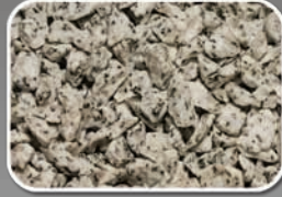
SNOW WHITE GRANITE