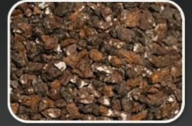
CHOCOLATE BROWN GRANITE