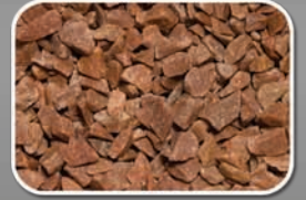
ROSE PINK QUARTZ