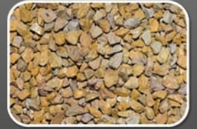
GOLDEN CREAM MARBLE*