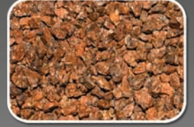
RED CEDAR GRANITE