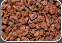
COLONIAL RED GRANITE