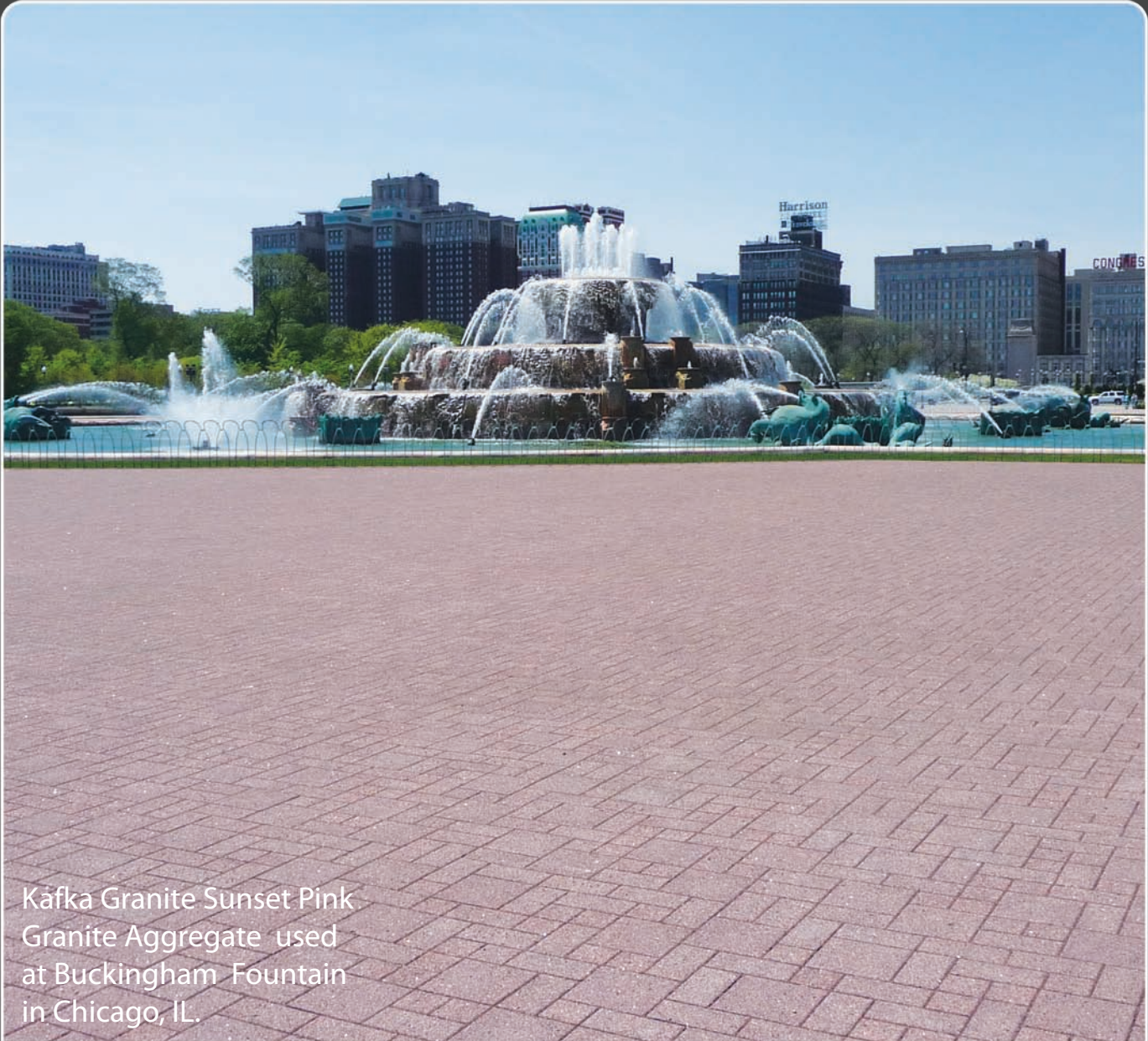
Kafka Granite Sunset Pink Granite Aggregate used at Buckingham Fountain in Chicago, IL.

PRODUCERS OF LANDSCAPE & ARCHITECTURAL AGGREGATES