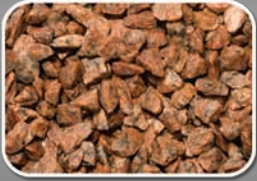
SUNSET PINK GRANITE