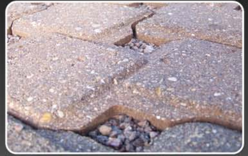
Project: Morton Arboretum Location: Lisle, IL Material: Blue Mahogany Granite