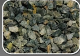
MIDNITE BLUE GRANITE