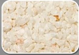
CRYSTAL WHITE QUARTZ