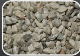
MISTY MTN GRAY MARBLE*