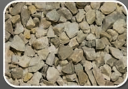
BOTTICINO GRAY MARBLE*