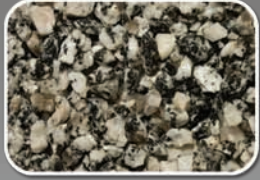
SALT & PEPPER GRANITE