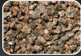
BLUE MAHOGANY GRANITE