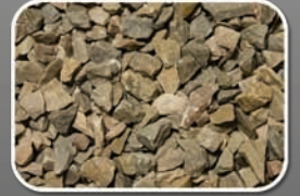
BEIGE BLEND MARBLE*