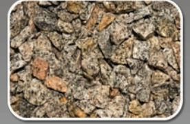
SUGAR & SPICE GRANITE