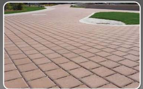
Project: Loyola University Location: Chicago, IL Material: Mauve Granite