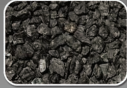
STARLITE BLACK GRANITE