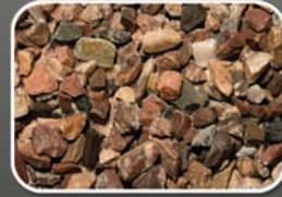
DUSTY ROSE MARBLE*