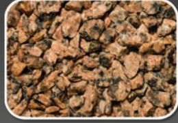
DYNAMITE ORANGE GRANITE