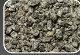
IMPERIAL GRAY GRANITE