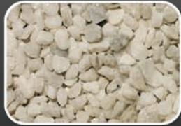
POLAR WHITE MARBLE*