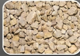
DESERT TAN MARBLE*