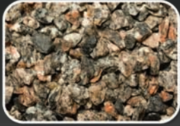
BLACK CHERRY GRANITE