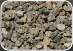
GUN METAL MARBLE*