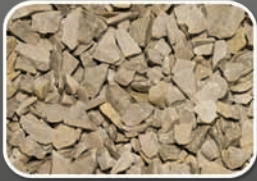
BOTTICINO WHITE MARBLE*