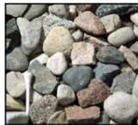
American Heritage Granite 1 1/2"