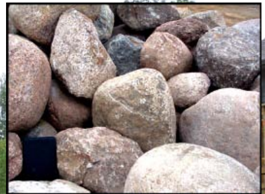
24+ Landscape Boulders