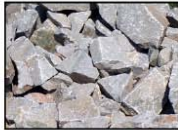
Imperial Gray Granite