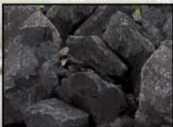
Starlite Black Granite