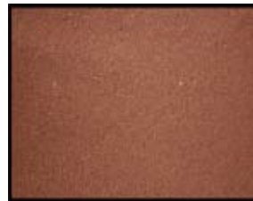
Burma Red Granite Hilltopper Infield Mix