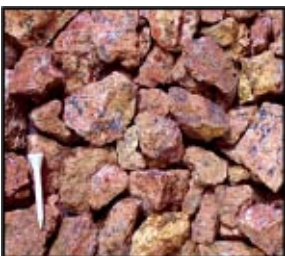
Rustic Granite 2" x 1"