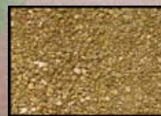
Desert Spar Granite