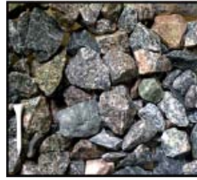
Black Cherry Granite 1 1/2"