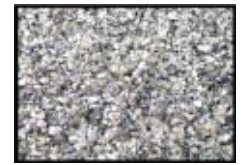
Salt & Pepper Granite