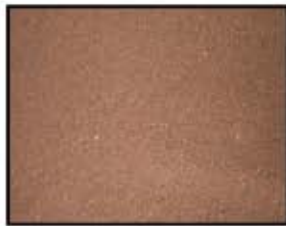
Burma Red Granite Infield Mix