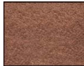
Ruby Red Granite Warning Track Mix