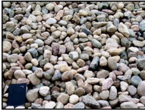
3-6" Landscape Cobbles

These smooth, rounded and multi-colored rocks are available in several sizes from 3" - 48". They are used for retaining walls, man made waterfalls, shoreline rip rap, and as accent pieces.