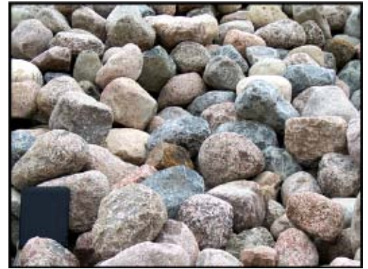
12-18" Landscape Boulders