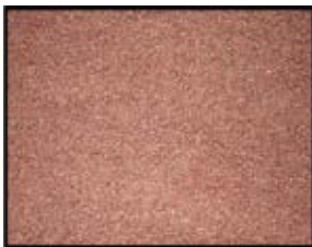
Ruby Red Granite Infield Mix

A Waterless & Dustless polymer-coated product. The polymer coating gives the clay a natural long lasting cohesion that does not require water for activation. Hilltopper is packaged in 50-lb bags and can be used for complete mound construction or used for renovation.