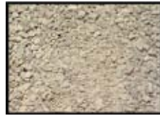
Beige Blend Marble