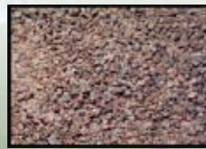
Sunset Pink Granite