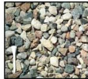
American Heritage Granite 3/4"