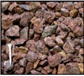
Ruby Red Granite