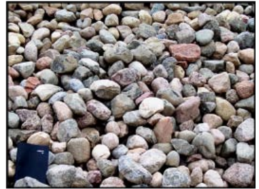
4-8" Landscape Boulders