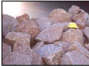
Dynamite Orange Granite