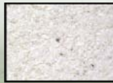
Crystal White Quartz