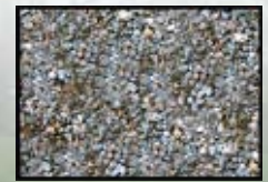
Blue Mahogany Granite