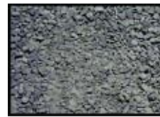
Midnite Blue Granite