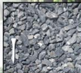
Midnite Blue Granite 3/4"