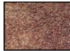
Colonial Red Granite