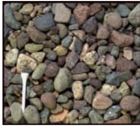
Cherry Creek Pebbles 3/4"