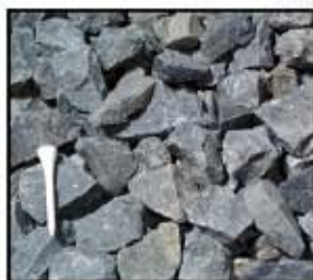
Midnite Blue Granite 1 1/4"