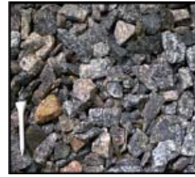
Black Cherry Granite 3/4"