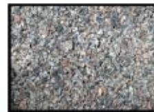
Black Cherry Granite