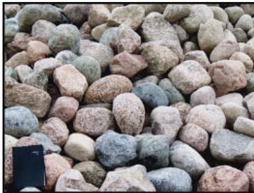
8-12" Landscape Boulders