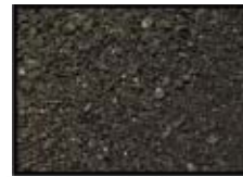
Starlite Black Granite