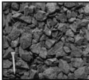
Starlite Black Granite