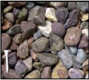
Cherry Creek Pebbles 1 1/2"