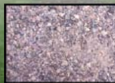
Antique Rose Marble