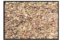
Dynamite Orange Granite