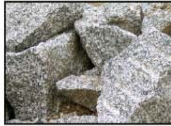
Salt & Pepper Granite