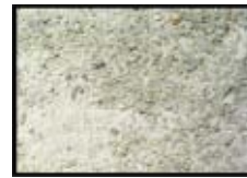
Misty Mountain Marble