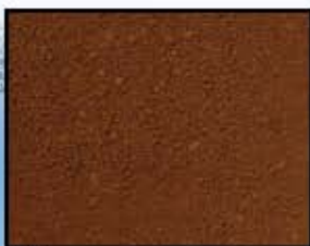
Hilltopper Mound Clay