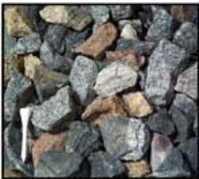
Pewter Granite 1 1/2"