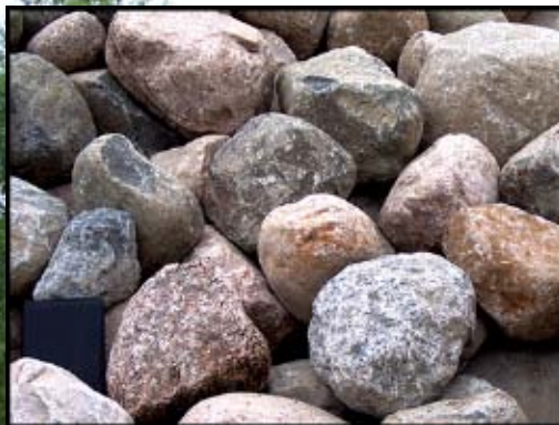
18-24" Landscape Boulders