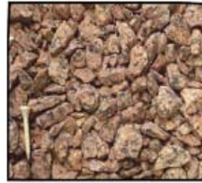
Dynamite Orange Granite