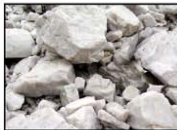
Crystal White Quartz