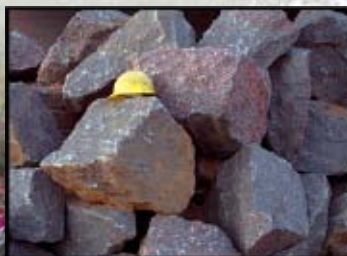
Blue Mahogany Granite