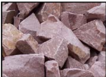
Sunset Pink Granite