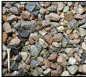
Pewter Granite 3/4"