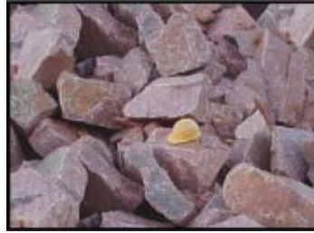
Ruby Red Granite