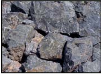
Midnite Blue Granite

Kafka Granite offers a variety of our raw materials in assorted sizes ranging from 4"-5'. These products are used for retaining walls, man made waterfalls, shoreline rip rap, and as accent pieces.