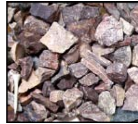
Antique Rose Marble