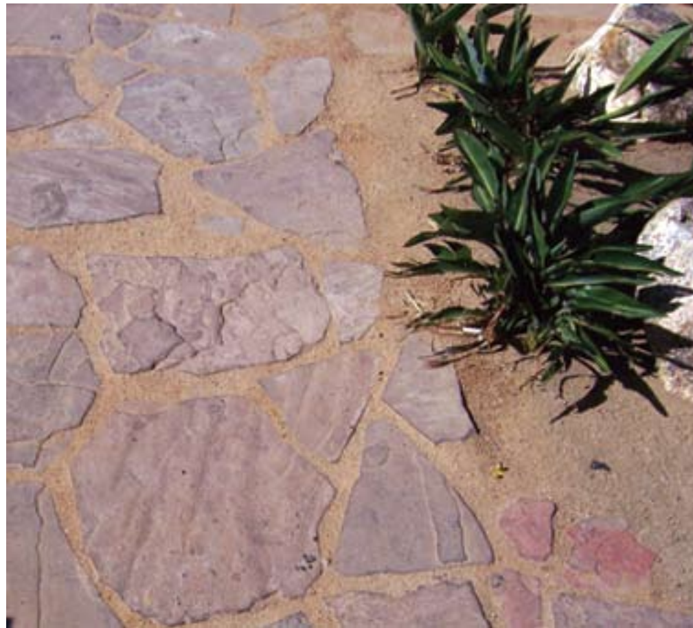
Residential Flagstone Patio, WI - Stabilized Desert Spar Granite Pathway Mix