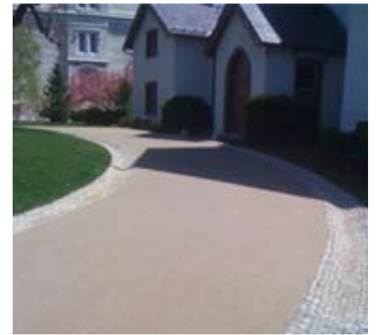
Lincoln Cottage, Washington, DC Beige Blend Marble StaNok® Pathway Mix