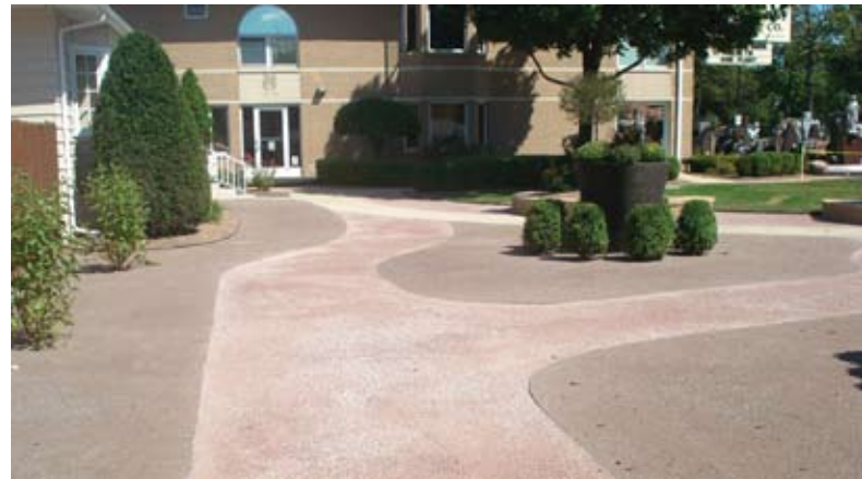
Troost Monument Company display area, Chicago, IL Stabilized Blue Mahogany Granite & Dusty Rose Marble Pathway Mix

LEED: Stormwater Management (2 points), Reduced Heat Island Effect (2 points), Local/Regional Materials (1 point) ADA Compatible POROSITY: Yes