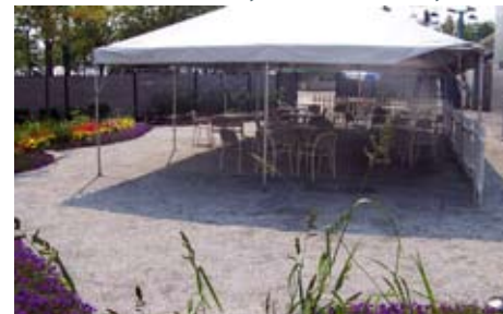
Miller VIP Oasis, Summerfest, Milwaukee, WI Stabilized Salt & Pepper Granite Pathway Mix