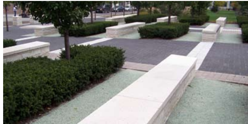
Lakeshore East, Chicago, IL - Stabilized Wintergreen Pathway Mix