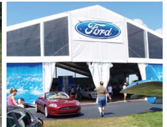
Ford Booth at EAA Airshow, Oshkosh, WI Midnite Blue Granite StaNok® Pathway Mix

LEED™ Potential- Positive Impact Stabilizer Solutions, Inc.'s family of products has the potential to improve your LEED™ accreditation. The LEED Green Building Rating System program of the US Green Building Council evaluates environmental performance from a "whole building" perspective. These "green building" standards are based on accepted energy and environmental principles. The LEED system rates new and existing commercial, institutional, and high-rise residential buildings. Credits are earned for each aspect of a particular project by satisfying the criteria set forth by the council. Based upon the number of credits earned, various levels of certification are awarded. More information is available at www.usgbc.org .