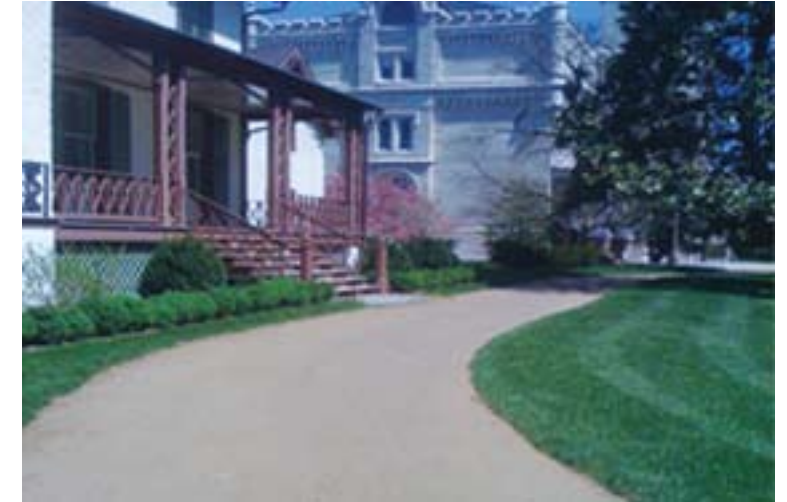
Lincoln Cottage, Washington, DC - Beige Blend Marble StaLok Pathway Mix