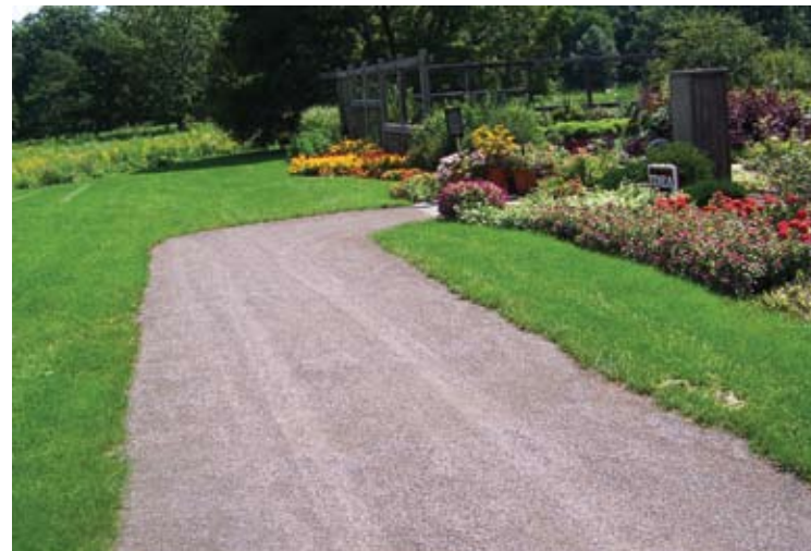
Cantigny Park, Wheaton, IL - Stabilized Pewter Granite Pathway Mix