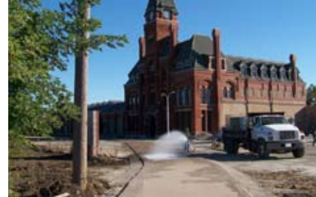
Install at Pullman Historic Site, Chicago, IL Stabilized Black Cherry Granite Pathway Mix