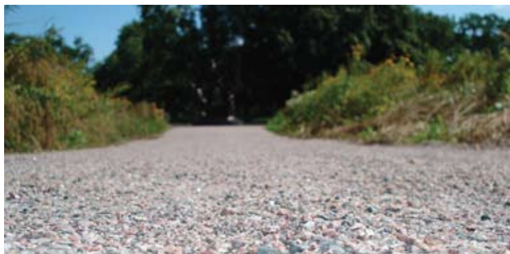
Cantigny Park, Wheaton, IL - Stabilized Pewter Granite Pathway Mix