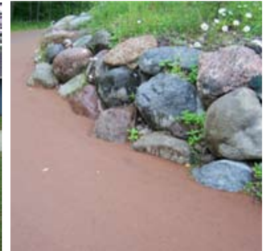
Rustic Granite StaNok® Pathway Mix