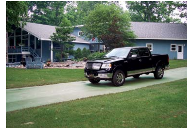
Residential Driveway, WI - Wintergreen StaNok® Pathway Mix

LEED Points: Reduced Heat Island Effect (2 points), Local/Regional Materials (1 point) ADA Compatible POROSITY: No