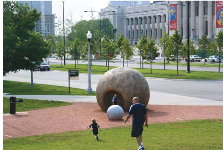
Burnham Park, Chicago, IL - Stabilized Rustic Granite Pathway Mix

The standard in waterless and water activated crushed stone drives, pathways, patios, parking and plazas.