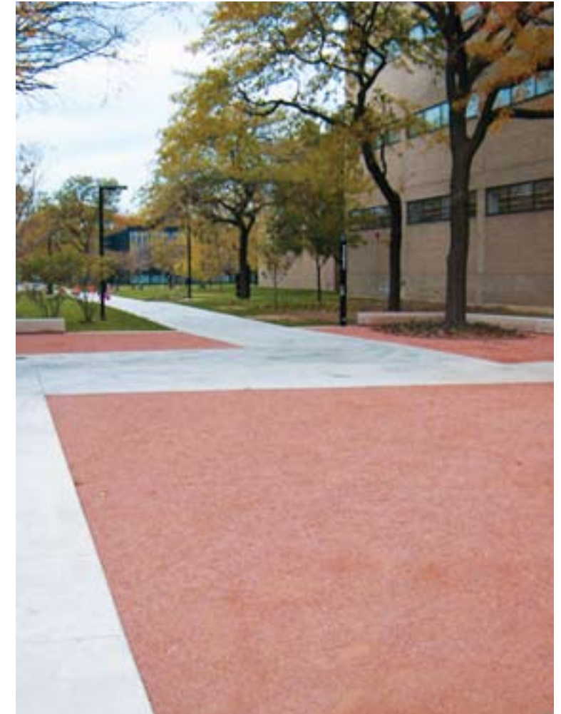
IIT Campus, Chicago, IL - Stabilized Rustic Granite Pathway Mix