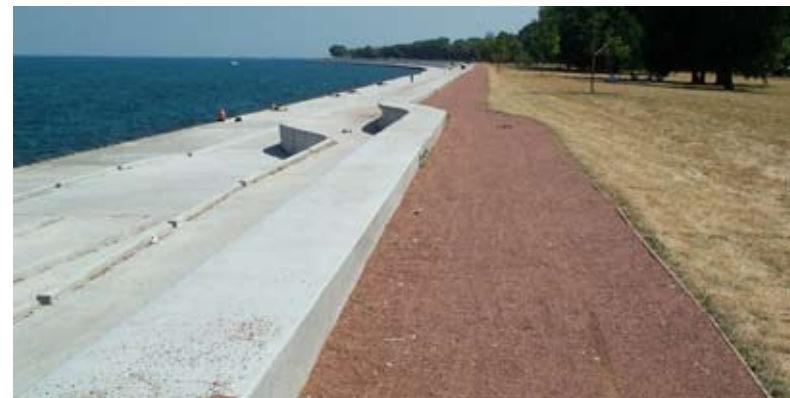
Lincoln Park, Chicago, IL - Stabilized Rustic Granite Pathway Mix