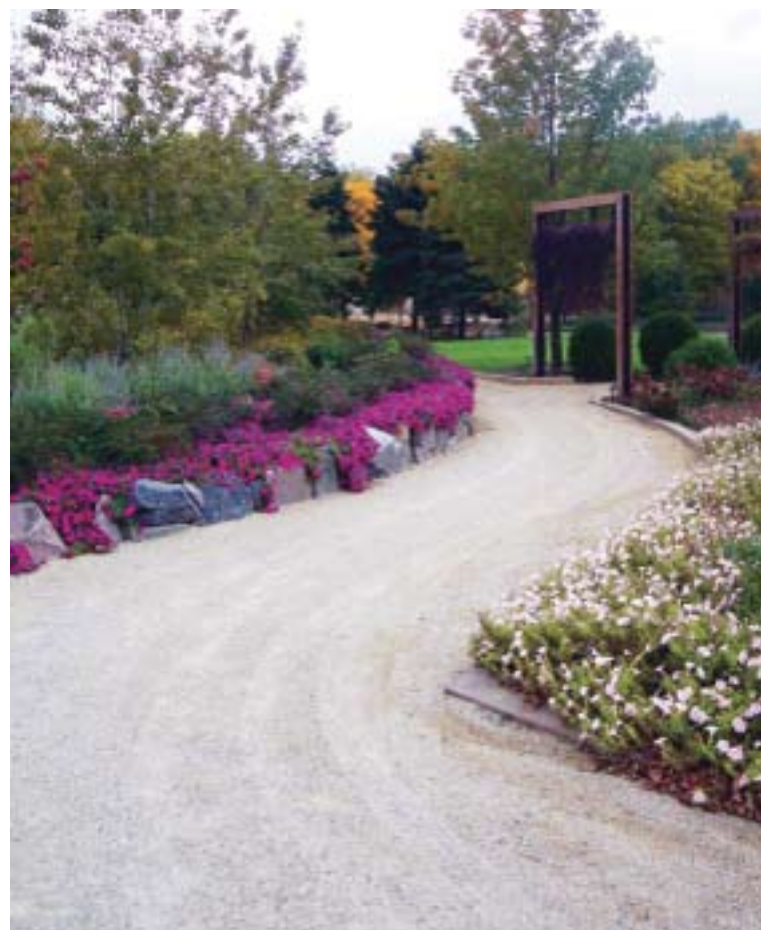
Ball Seed Company Grounds - Stabilized Limestone Screenings West Chicago, IL