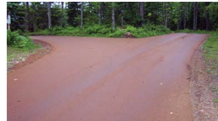
Residential Driveway, WI - Rustic Granite StaNok® Pathway Mix