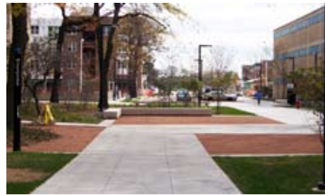
IIT Campus, Chicago, IL Stabilized Rustic Granite Pathway Mix